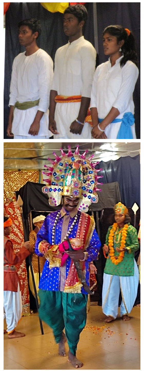
Shramdaan (Work Offering)