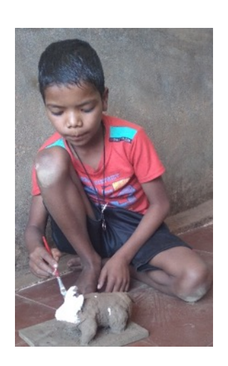
beautiful colours to them.

He took time to remember his dialogue. He was confident during the presentation. His favourite vegetable is sweet potato. He learnt the names of different animals and made animal chart with his friends. He learnt how to make animals with clay and gave