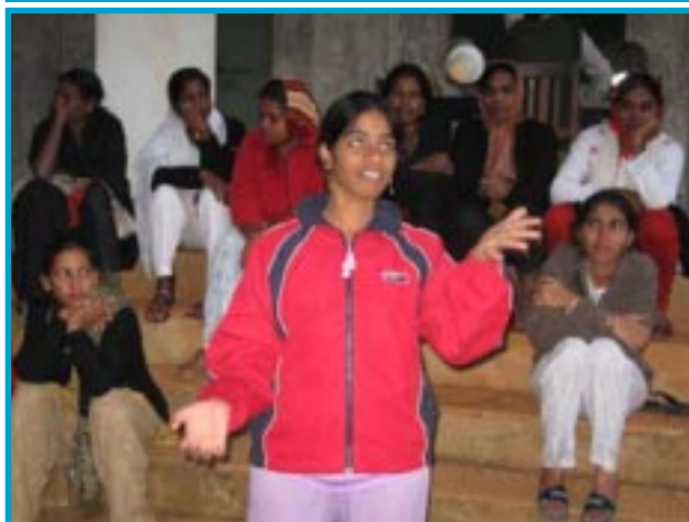
Eye Care - ball play