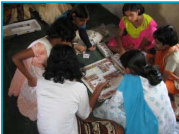
Imbibing values through Ramayana Game