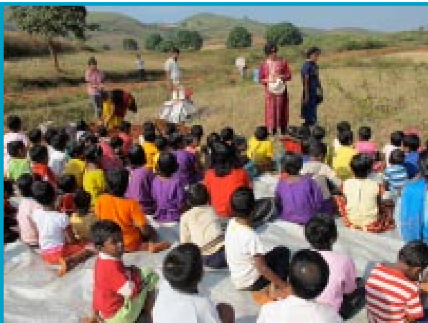
AMVM School Foundation Stone laying