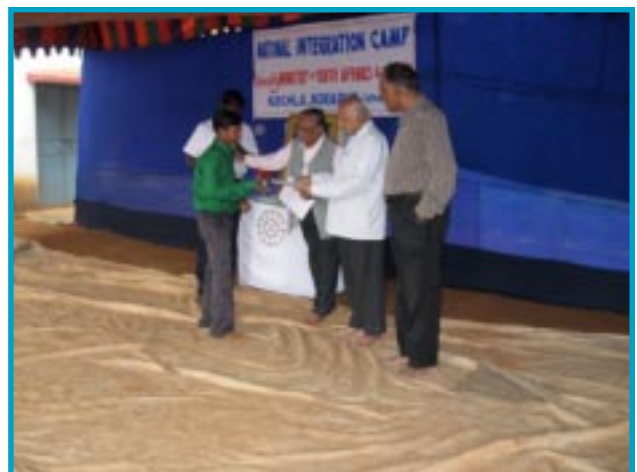
Award of Certificates