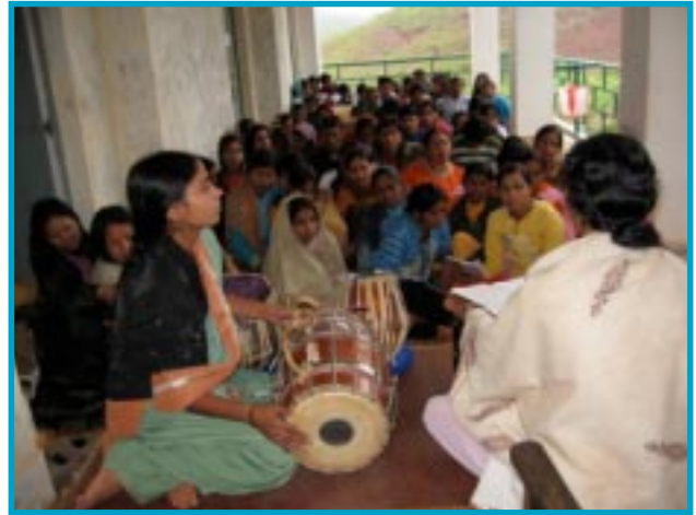
Practice for Valedictory Function

participants travelled from a long distance, for instance from Haryana and Uttarakhand, changing train three times in the process. Participants came from Uttarakhand, Delhi, Maharashtra, U.P., Odisha, M.P. Bihar, Haryana, W.B., Chandigarh, A.P., Tamilnadu. Despite language barrier in some cases, attendees made friends with people from distant regions and different cultures. Activities of the camps focused on physical fitness & health, unity in cultural diversity, and integration of people from various parts of the country. Interaction with the local tribal people, children of the school and adults created much hilarity at times due to language barrier and people were seen interacting with sign language and pantomimes. Activities included yogasanas, keep-fit, shramdan, talks and discussions, visit to the hamlets of village Kechla, trekking in the forest and to the hill tops and during the night hours to build stamina and remove