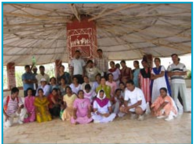
Village Goshthi Ghar