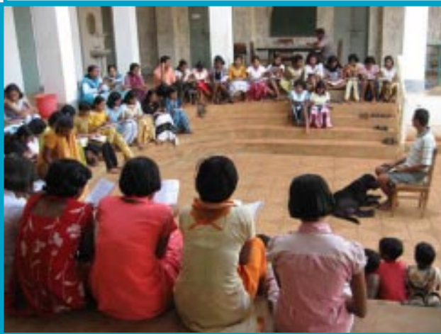
Value based talk & discussion