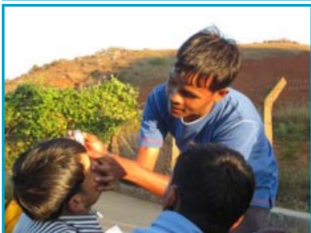
Eye Care - application of honey