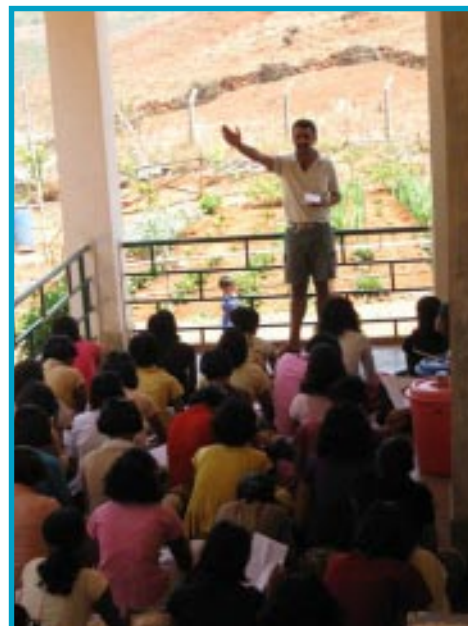
Talk on value-based topics