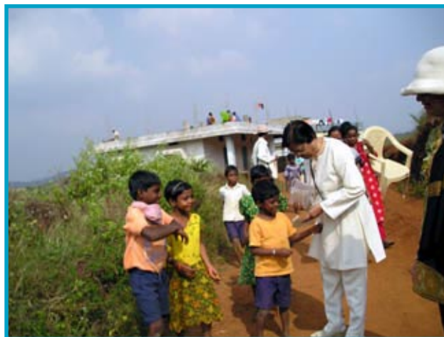
Tara didi with school children