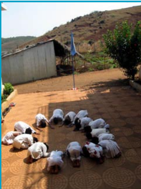
21st February. Mother's birthday Dance by AMVM students

Darshan Days: All Darshan Days are celebrated with children offering flowers, listening to stories about the Mother and Sri Aurobindo, chanting slokas and singing bhajans, and attending a session of meditation.