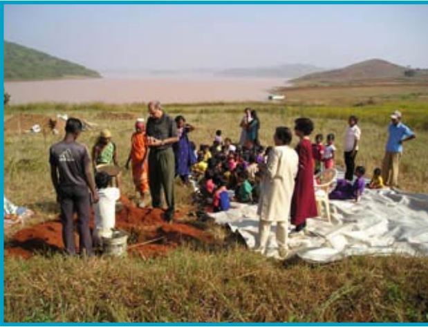
Foundation ceremony of AMVM School

We also inched closer to completing the girls hostel building.