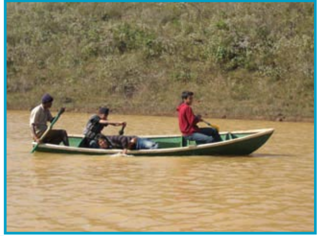
Swimming and Rowing on the Kolab River Reservoir