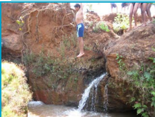
Adventure & fun at waterfall