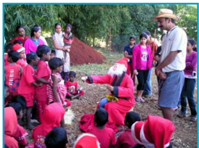
MIS & MVM students on Christmas

Christmas - The students of The Mother's International school were in Kechla during Christmas. The children had made a Christmas tree and decorated it. They also made caps, Santa Claus and gifts. They prepared and decorated the field for an outdoor programme. The whole school was wearing red dresses. A student of the Mother's International School dressed up as Santa Claus distributed gifts. All children sang Christmas Carols.