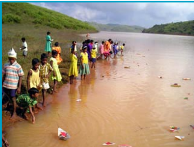
Kartik Purnima - Paper boats in Kolab

Kartik Purnima - The children made boats. Everyone sang songs which had been made by them when the boats were put in the reservoir. Puja ceremony with incense, candles and flowers was performed.