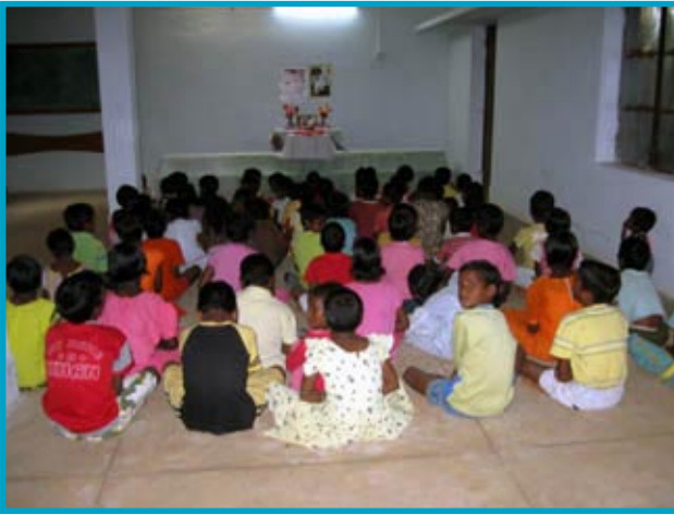
Meditation on New Year's Day

Kartik Purnima - The children made boats. Everyone sang songs which had been made by them when the boats were put in the reservoir. Puja ceremony with incense, candles and flowers was performed.