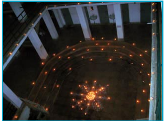
Dipawali in the Ashram

Deepawali - Diyas and candles made by the children were lighted the whole campus. Children enjoyed decorating their classrooms. Children also prepared and presented a programme was put up where the children had dance performance and also sang songs they had written.