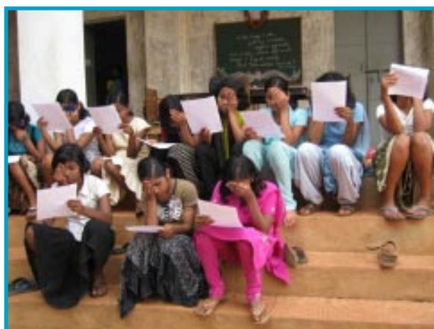
Eye Care - Fine Print Reading

clarification of differences between values and virtues, use & misuse of money, environment and sustainable living, need & greed, responsibility & accountability, how is the society moulding us and vice versa, etc. were some of the topics thoroughly debated during the camps. Other activities included morning yogasanas & keep-fit, shramdan, trekking, rappelling, swimming, rowing, eye-care workshop, cultural evenings with music, dance, skit, plays, visit to the hamlets of Kechla, learning of community and patriotic songs in many languages, etc.