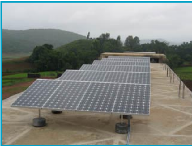
Solar system on the roof of Hostel

We also inched closer to completing the girls hostel building.