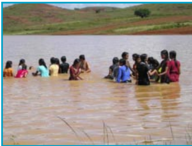
Dip in the Reservoir is fun