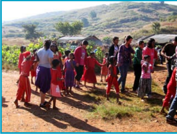
MIS class IX students and AMVM students on a trek