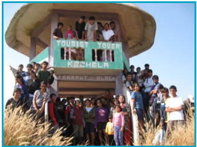
Excursion to Kechal Tourist Tower