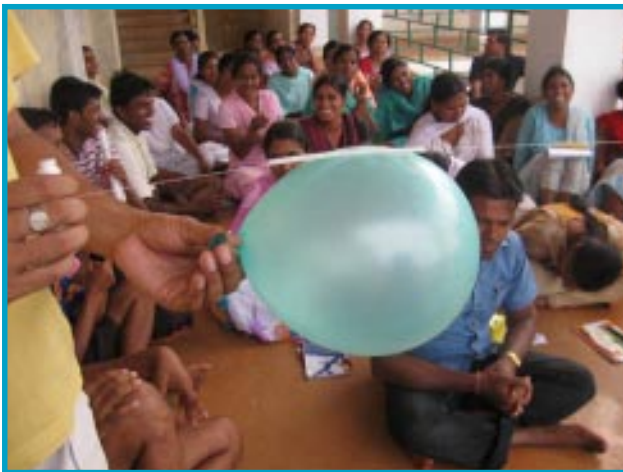
Workshop on teaching Science