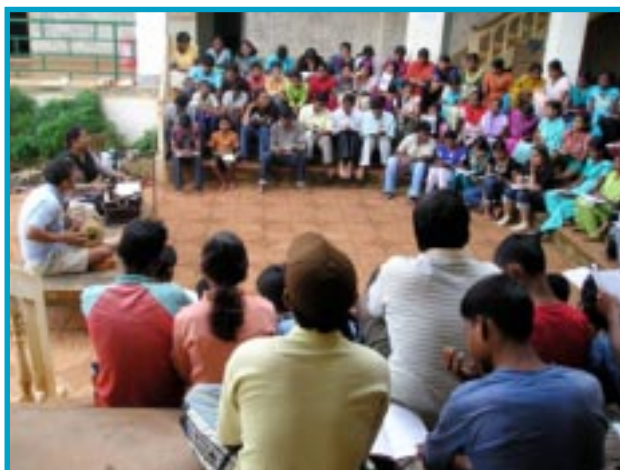
Learning community songs