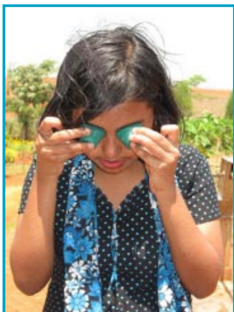
Eye Care - Blinking in Water