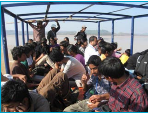
On the Kolab River Reservoir