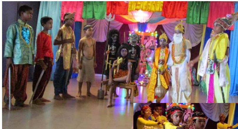
Progress group- Ganesh and the Moon