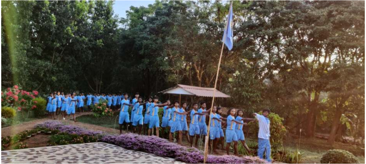
24 TH NOVEMBER- The Darshan day for Siddhi Divas was celebrated by collective meditation in the ashram