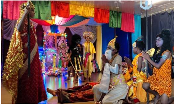
Humility group girls- Eka Dantaya Vakra Tundaya