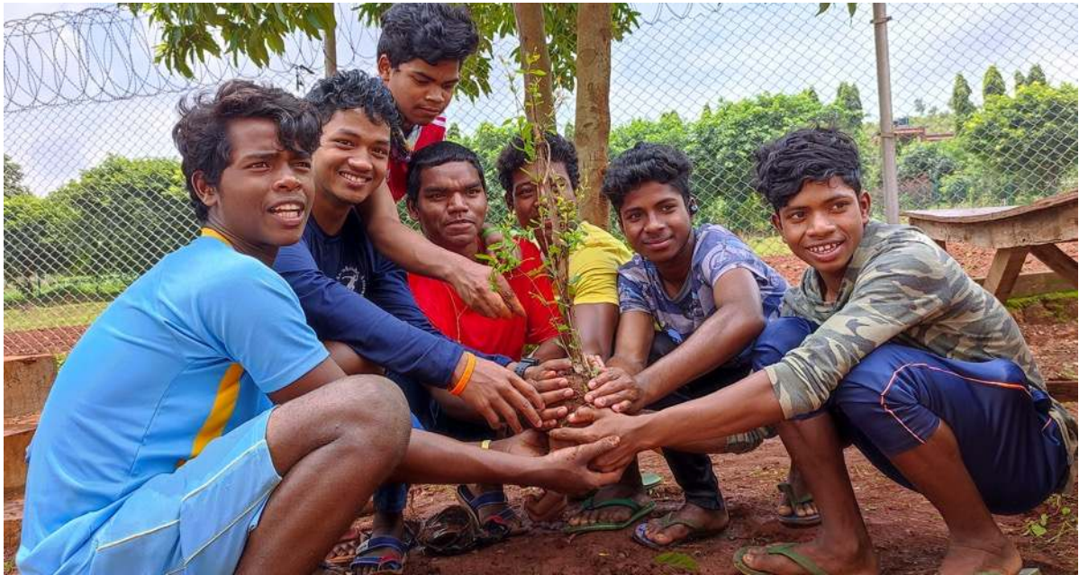
12 TH JULY- Rath Yatra

The auspicious occasion of Rath Yatra was celebrated on 12th July. The idols of Lord Jagannath, Balabhadra and Subhadra were decorated on the sanctum in the meditation hall and children sang devotional songs. Mantras were chanted to invoke the power of the deities. The teachers narrated some stories on the festival. Everyone enjoyed the prasad.