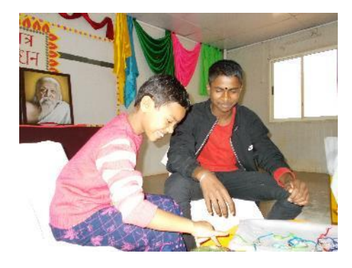
On 5<sup>th</sup> July, we did a play called "Ouch!" and we did it nicely. From 5<sup>th</sup> to 10<sup>th</sup> August, we did