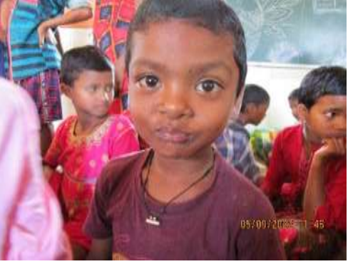
brushes his teeth independently. Now good food habit as he only eats rice, dal happily gets involved in all the activities