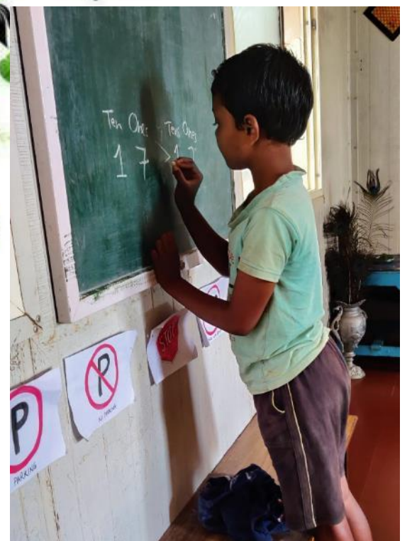
showcasing her resilience and commitment to learning.