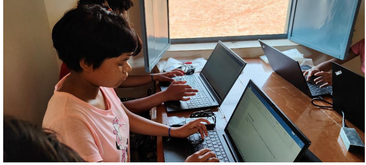
In Computer class, I like to do painting and typing. I have

had a problem in factorization because I couldn't understand it properly. Computers