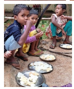
FOOD- She eats all the vegetables and does not waste food. She does not drop her food. When she's done her plate is clean.