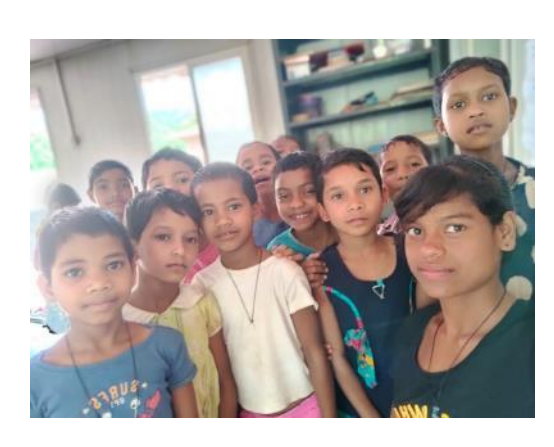
8:30- 9:30 English class with Grace group