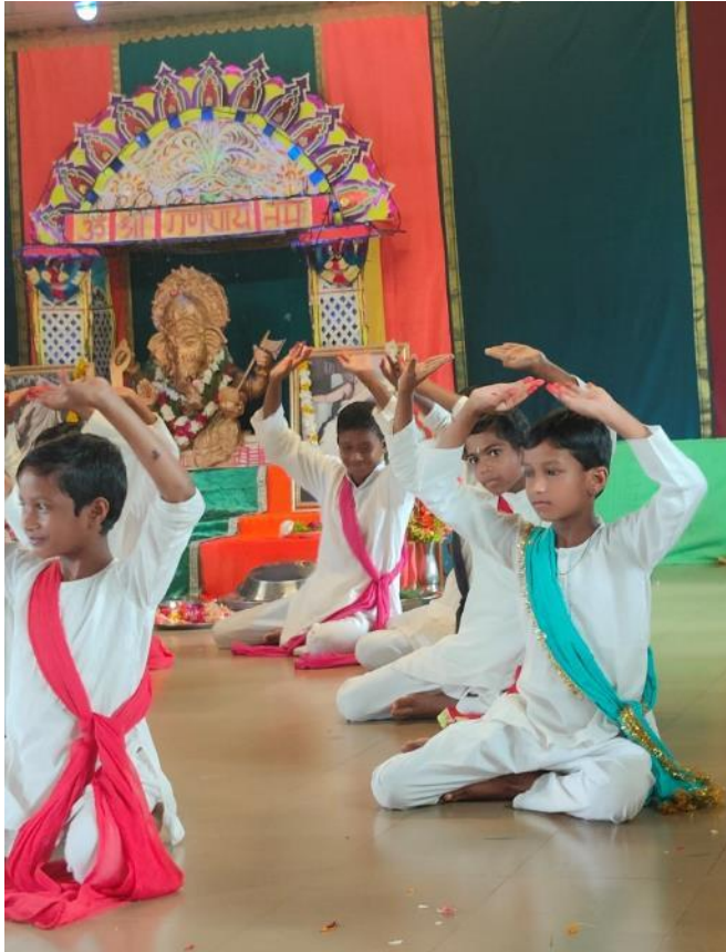
Ganesh Chaturthi, especially because of the ladoos he gets to eat.