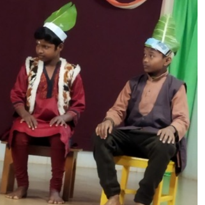
Christmas – We sang carols nicely with music.