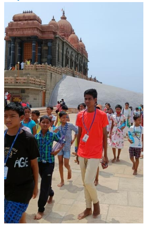
Trip to South India